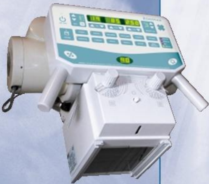
The new ZooMaX Control with the "Hawk" CX-MC 150 collimator